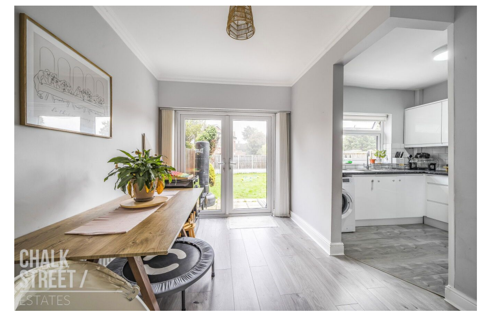
Tax Band: C Furnished: Unfurnished

Ideally located, just 0.5 miles from Romford Elizabeth Line Station, the home enjoys further excellent transport links being a short stroll to several major bus routes, Romford Town Centre, is this 3 bedroom, end of terrace house