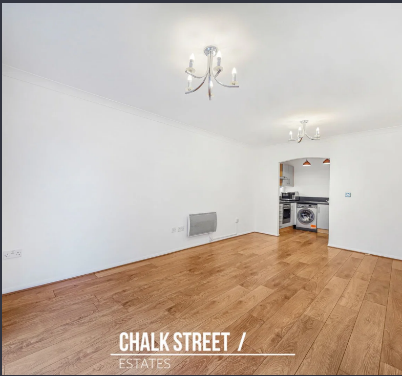
CHALK STREET / ESTATES