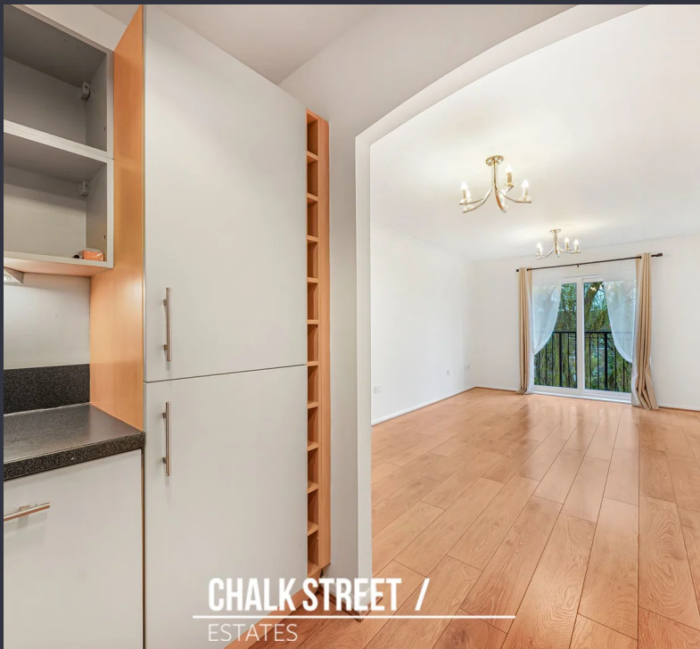
CHALK STREET / ESTATES