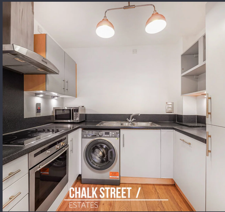
CHALK STREET / ESTATES