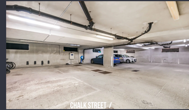
CHALK STREET /

Floor plan produced in accordance with RICS Property Measurement 2nd Edition. Incorporating International Property Measurement Standards (IPMS2 Residential). Produced for © Chalk Street Estates Limited.