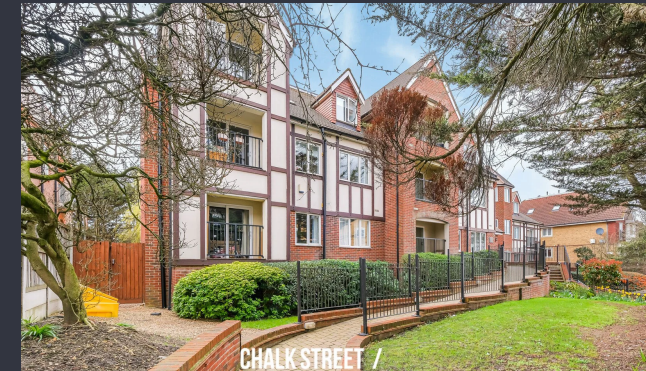
CHALK STREET /