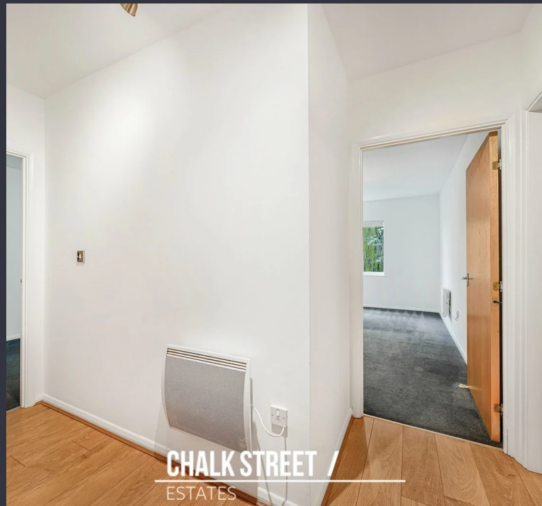
CHALK STREET / ESTATES