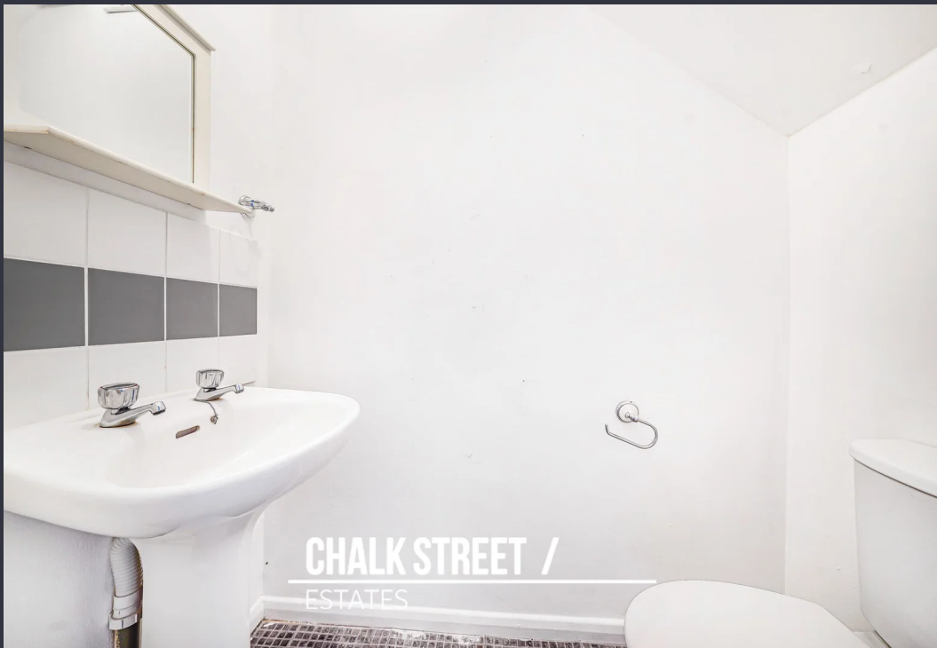
CHALK STREET / ESTATES