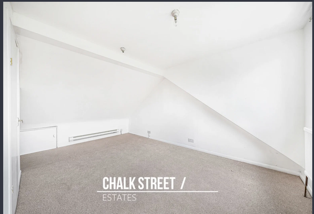
CHALK STREET / ESTATES