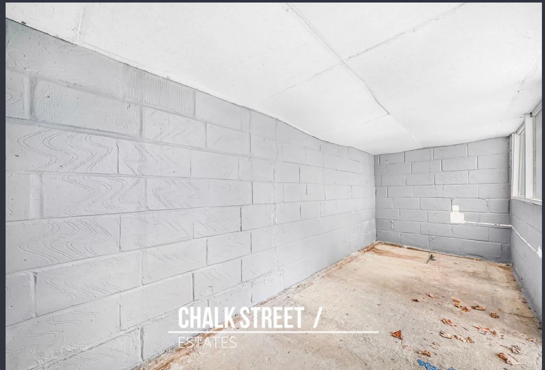
CHALK STREET / ESTATES