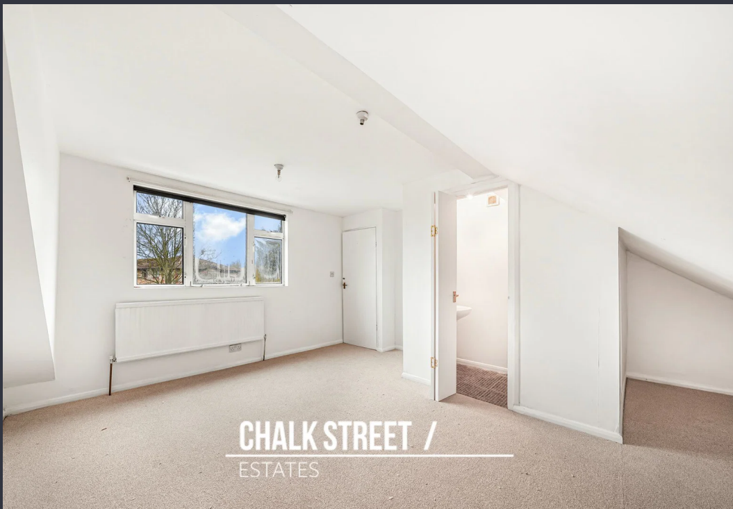
CHALK STREET / ESTATES