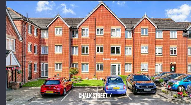
CHALK STREET /