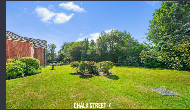
CHALK STREET /

Floor plan produced in accordance with RICS Property Measurement 2nd Edition. Incorporating International Property Measurement Standards (IPMS2 Residential). Produced for © Chalk Street Estates Limited.