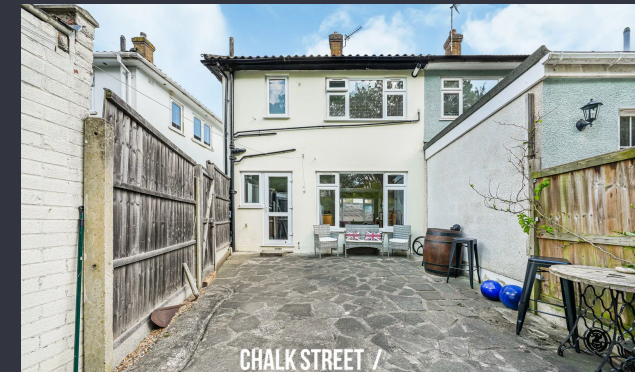
CHALK STREET /