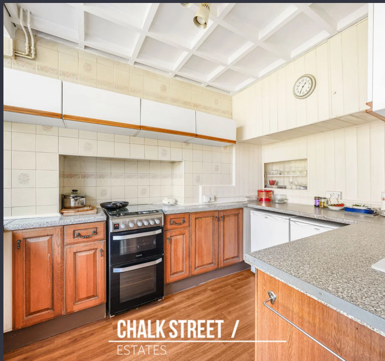
CHALK STREET / ESTATES