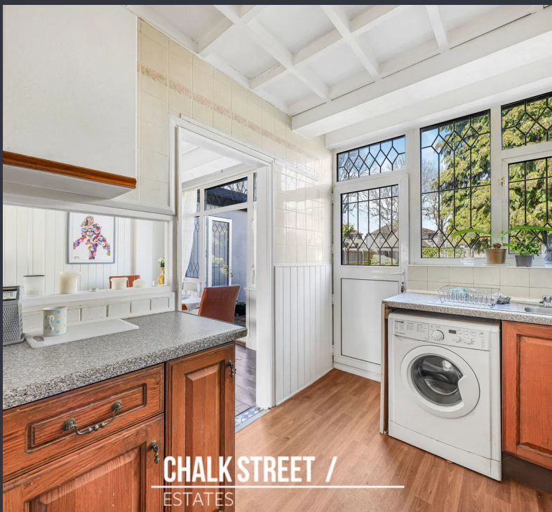
CHALK STREET / ESTATES