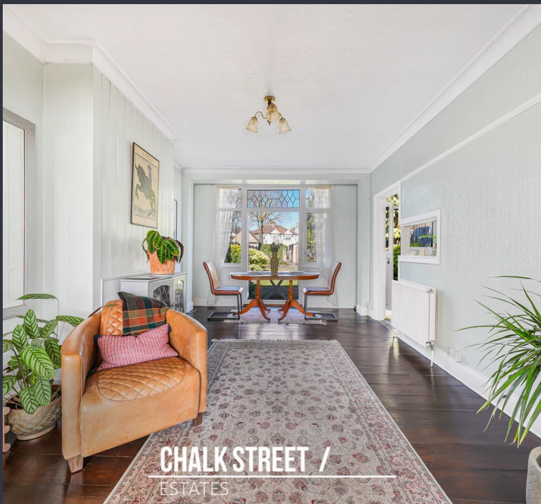
CHALK STREET / ESTATES