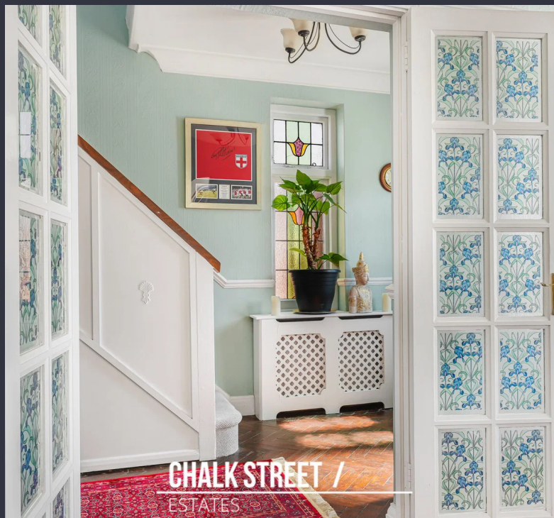
CHALK STREET / ESTATES