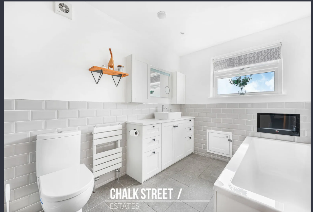
CHALK STREET / ESTATES