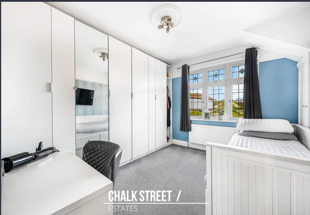
CHALK STREET / ESTATES