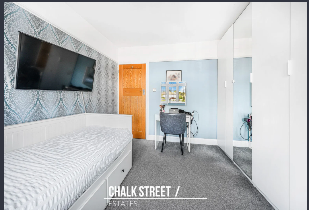
CHALK STREET / ESTATES