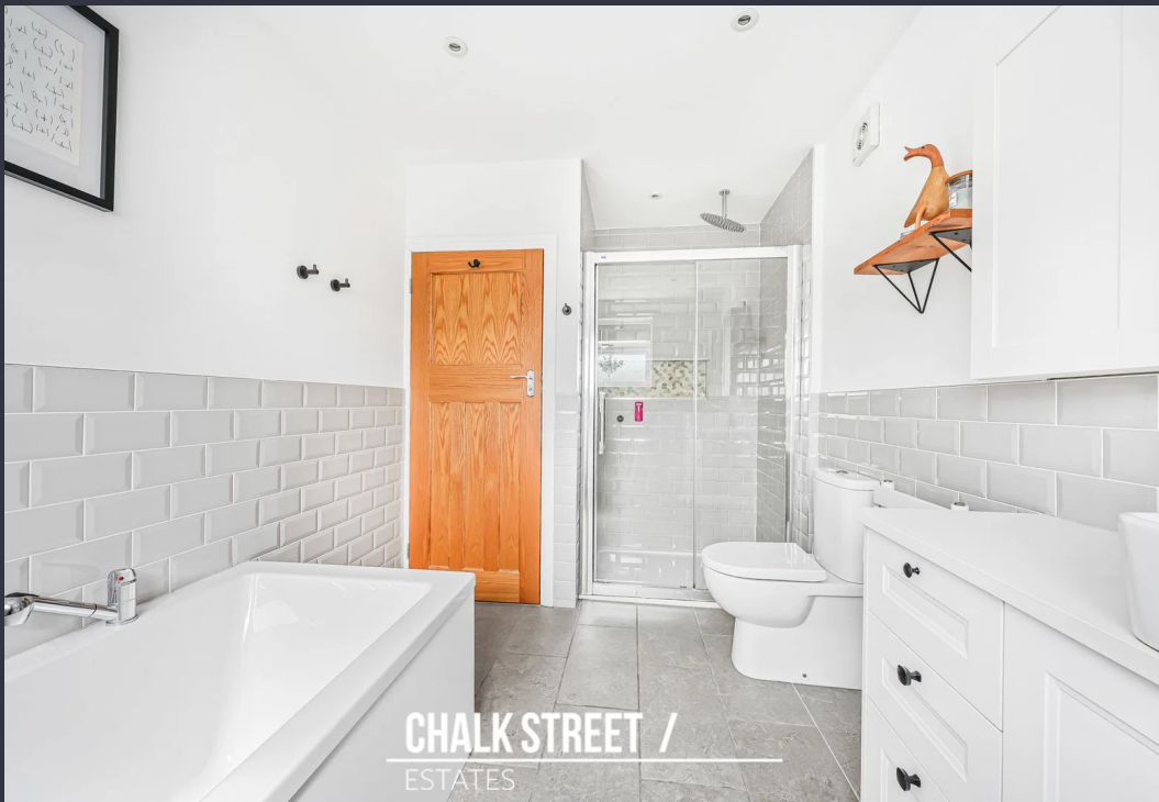
CHALK STREET / ESTATES