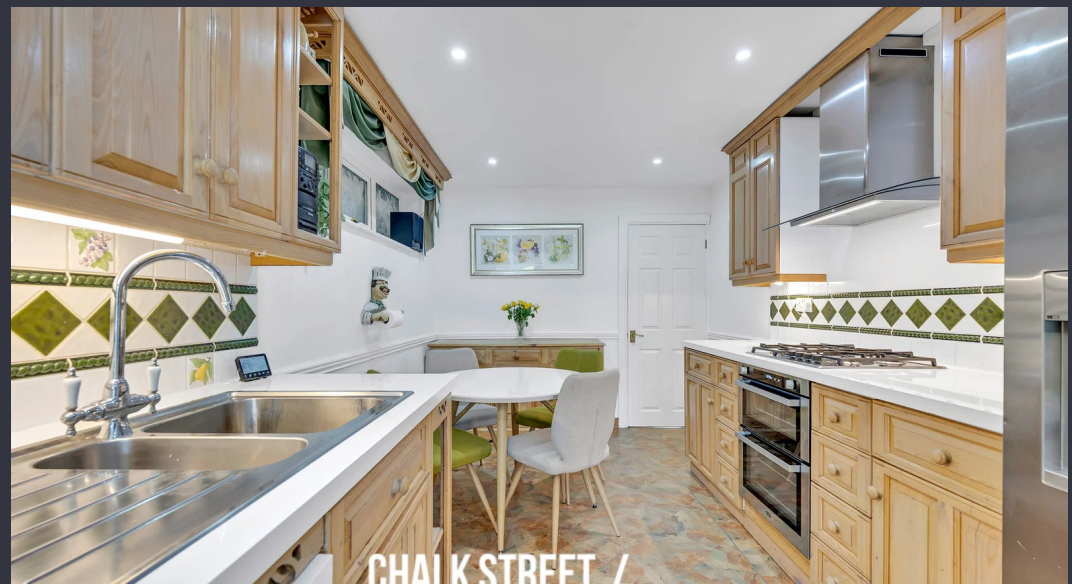
CHALK STREET /