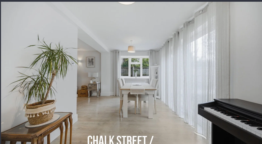
CHALK STREET /